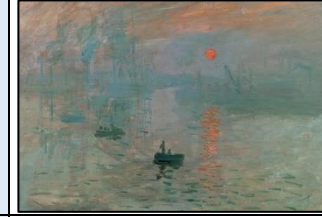
Impression, Sunrise (1872)

- Impression, Sunrise is often credited with inspiring the impressionist movement. -It shows the port of Le Harve – Monet's hometown at the time. The two small boats in the foreground and the red sun are the main subjects. -Features of industry are shown in the background, billowing chimneys and a hazy sky.