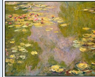
Water Lilies (1919)

- Water Lilies is one of Monet's most well-known paintings. It is a part of a series on water lilies. -It is one of his larger paintings, measuring 101 x 200cm, and is an oil-on-canvas. -At the time of producing this, Monet was already 70 years old, and mainly painted the natural beauty in his own garden and pond in Giverny. -The paintings demonstrate Monet's interest in natural beauty, and how it changes in light.