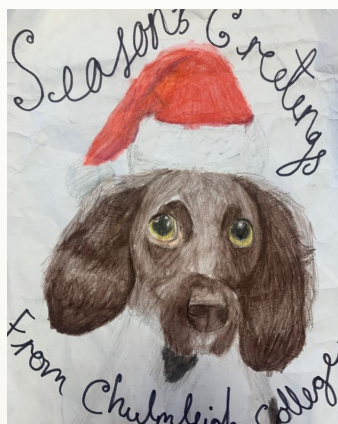
Leila Hooper 7NM